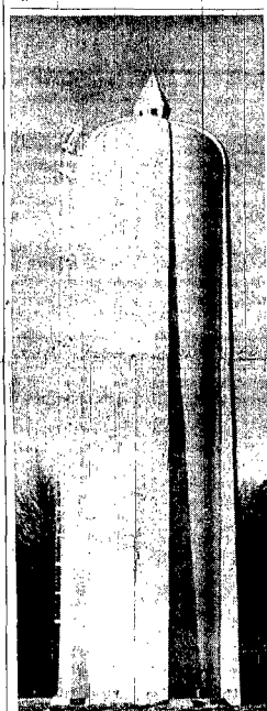
WAYNE'S NEW WATER tower will be the same as this one. Capacity will be 750,000 gallons and, used along with the present tower, will give Wayne more water pressure and also a greater emergency safety factor.