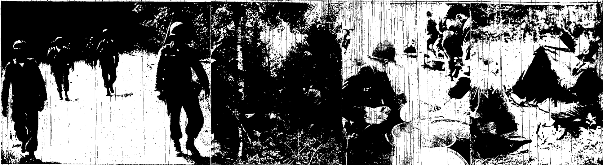
NINETEEN-HOUR DAYS of intensive training marked the first week of the Wayne National Guard unit's summer training at Camp Ripley, Minn. The unit went directly to the field the first week to put into practice knowledge gained during the year's weekly meetings in Wayne. Field training under combat conditions showed up any soft spots in the men's condition as the days started