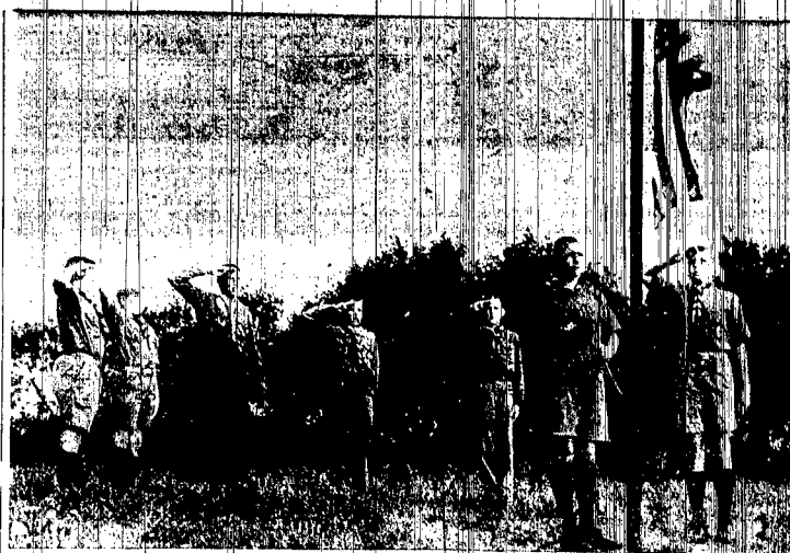
RAVEN PATROL, Troop 174, brought home the honor patrol award for its performance at scout camp last week. The patrol (twice) won the daily honor award and also claimed awards several times as the best-appearing patrol. Members are